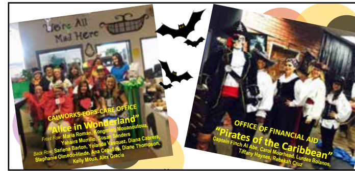
CARWORKS/EOPS-CARE OFFICE "Alice in Wonderland"