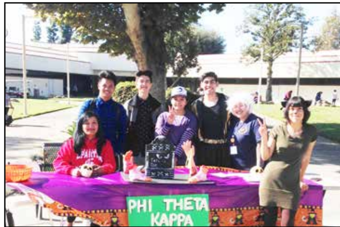
Phi Theta Kappa Club