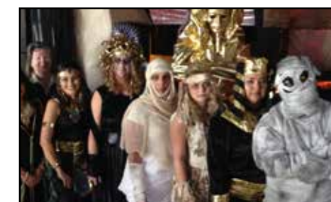
Admissions & Records