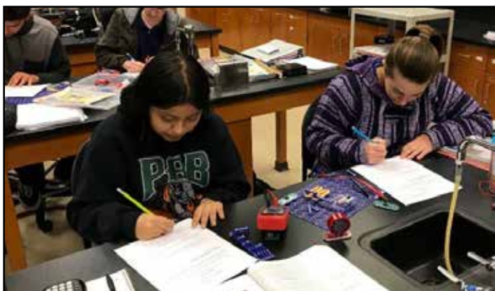
Physics students using our new voltmeters and circuit boards